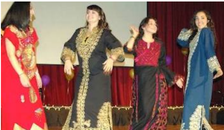
Arabian Night, which began as an official cultural night for the first time last year, returns Thursday, 6–9 p.m. in the Soda Center. This year's theme, "Around the Family Table," reflects the Middle Eastern cultures represented at SMC.

Learn how to submit Events and Announcements.