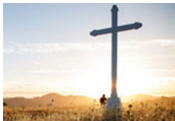
For the week of April 20 .

Learn how to submit Events and Announcements.