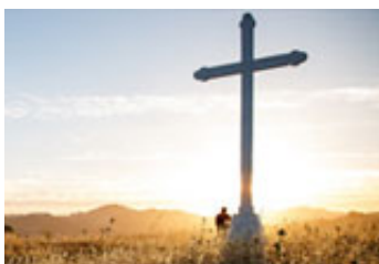
For the week of May 11 .

Learn how to submit Events and Announcements.